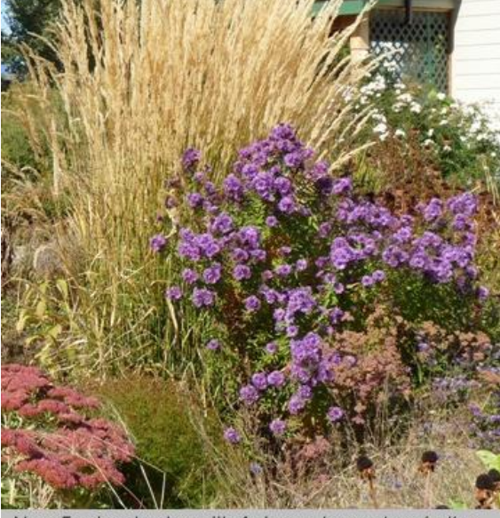
New England aster with Autumn Joy sedum in the foreground and Darlowe's Enigma white rose in the back. Grass is Karl Foerster feather reed grass

Although the bees consider the Autumn Joy sedum to have finished flowering, the dry flower heads look every bit as good as the fresh flowers to this gardener. I'm going to divide some of the clumps next spring so that I can have more of it to watch next fall. It tolerates heat and infertile soil, so it's a very handy plant to have around. Also still flowering is my Darlowe's Enigma shrub rose and the Johnny Jump Ups. The rose began flowering in July, and the Johnny Jump Ups in April—that's a lot of flowers. There are other flowers in my garden, but not in their glory now as they were in spring and summer. Still, every flower is welcome before the long cold spell that is to come.